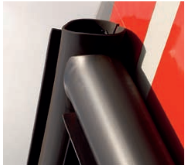
Rubber bellows in use